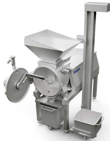
STEPHAN TC COMBICUT