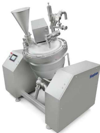
STEPHAN Universal Machines