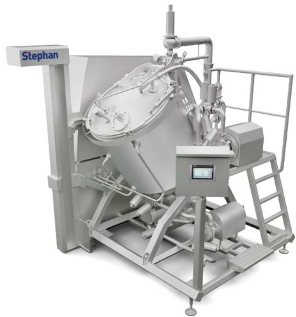
STEPHAN VACUTHERM® SYSTEM