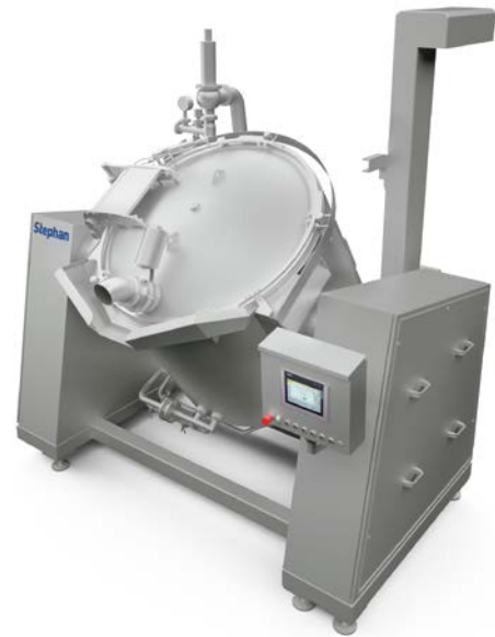
STEPHAN Cooking Mixer