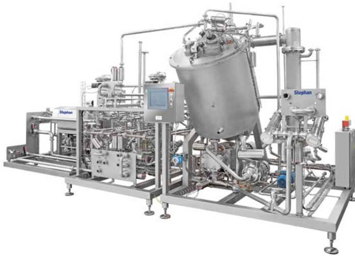
STEPHAN UHT SYSTEM